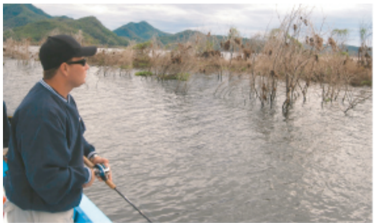
BRUSHY POINTS PRODUCED fish on every cast — all types of bait were effective: plastic worms, swim baits, spinnerbaits and crankbaits.

After the first day of fishing, I have to agree with Chapman and the couple about the fish-