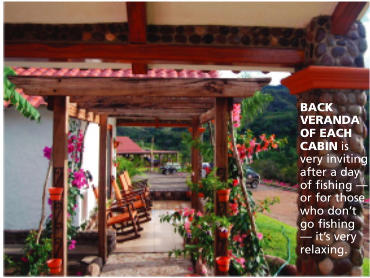
BACK VERANDA OF EACH CABIN is very inviting after a day of fishing — or for those who don't go fishing — it's very relaxing.