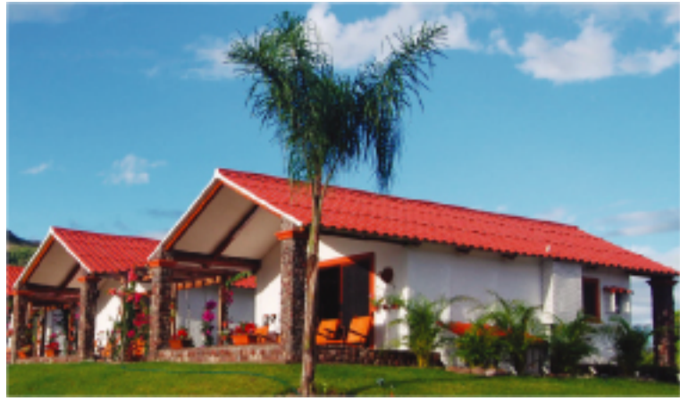
UPPER ROOMS OF LODGE at Anglers Inn at Lake Mateos. And the facility was built in just 4 months with intensive labor.