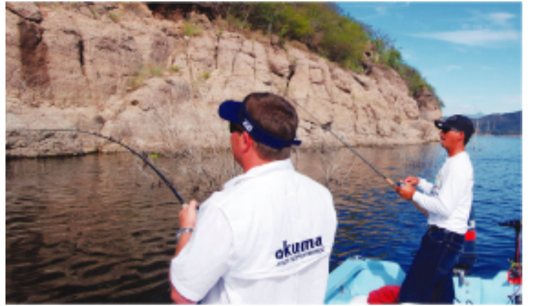
ROCK BLUFFS PRODUCED PLENTY of fish for the Grand Opening guests. This was some of the best surface fishing this writer has seen in 43 years of bass fishing!

Each of the six cabins features a private bathroom and a single and two double beds. They're really built for 2 anglers, but 3 can be accommodated. Each room features an air conditioner but there's an additional A/C unit installed as a back-up. There is a TV set and DVD player in each room, with DVD movie selection available at the Anglers Inn tackle shop. Free wireless Internet service is offered with laptops avail-