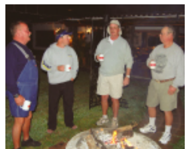
OUTDOOR FIREPIT WAS a great place to rehash the day's great fishing experience!

Lake Mateos is located about 55 minutes drive from the Culiacan Airport and Anglers Inn will pick you up there for transportation to the lodge. The airport is serviced from several U.S. cities by Delta, Mexicana and Aeromexico airlines. The only non-stop route is Delta out of Los Angeles.